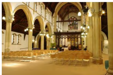
This is an example of a church showing the flexibility of seating.